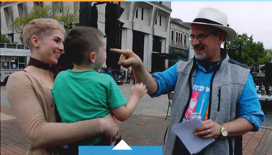
Having fun at the 2019 United Way Wild Cookoff!